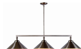
ACCENT LIGHTING KENROY OUTLOOK 93247ORB