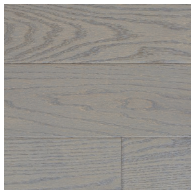
FLOOR BEAUFLO AMERICAN OAK SLATE 38611