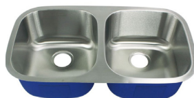
SINK TRANSOLID MUDE 32189 16 GAUGE, 3MM SOUND DAMPENING STAINLESS STEEL UNDER MOUNT