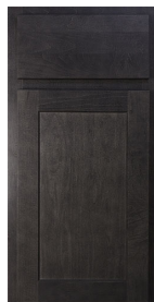
CABINETS KOUNTRY WOOD GEORGETOWN SLATE